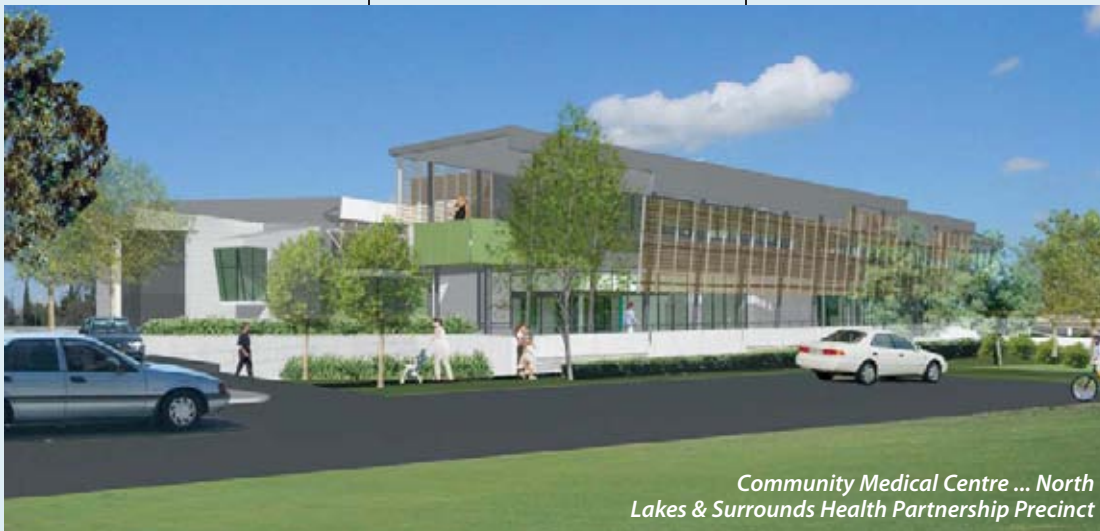
Community Medical Centre ... North Lakes & Surrounds Health Partnership Precinct