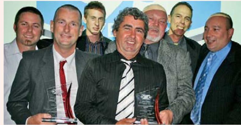
Hutchies' Internal Lining Division won the overall award for Best Commercial Project in Australia and New Zealand for the Emporium Hotel.