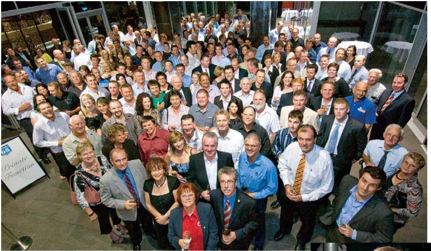
Hutchies' Toowoomba office ... held their 95th party on November 28th at the Trilogy Apartments, Swish Wine Bar (a project recently completed by the Toowoomba Crew).