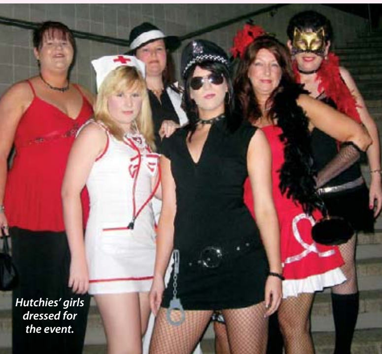
Hutchies' girls dressed for the event.